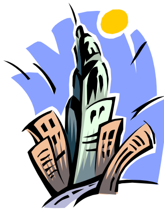
GOOD TO BE BACK FROM THE NEW YORK A.A. GENERAL SERVICE CONFERENCE !

referral, at such a late date, to one of our Conference Committees. I voted with the majority. I could see no point to sending the item, with no background and no