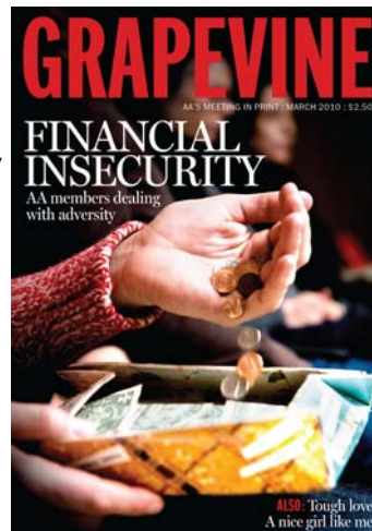
The March 2010 Grapevine has arrived! Special section: Financial insecurity The Promises come true for AAs, even in tough times

The Grapevine Board has implemented a plan to