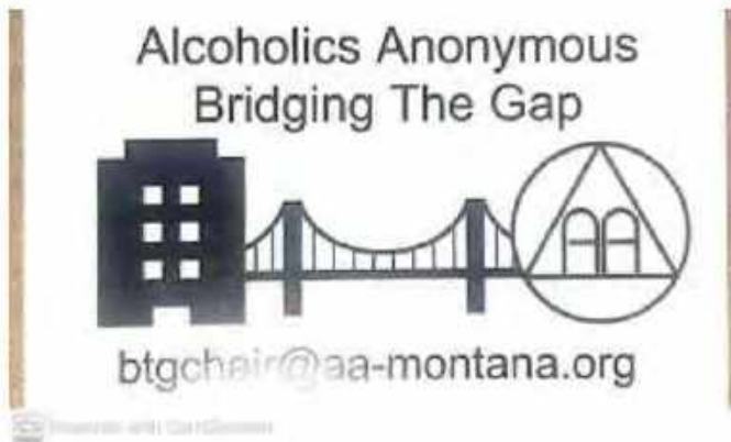
Figure 2 Front side of BTG card