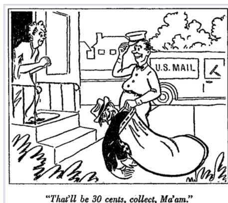
June 1946 Grapevine