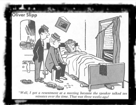
July 1961 Grapevine

Nashville, Tenn., February 1949 "Thoughts for the Newcomer" AA Grapevine