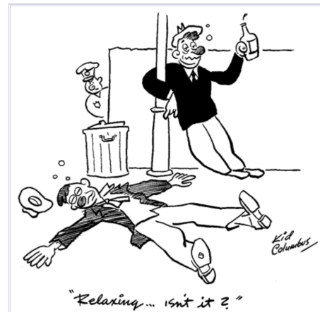
July 1948 Grapevine